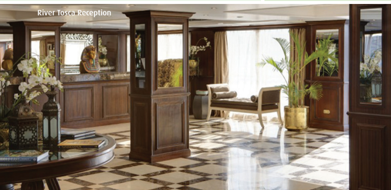
River Tosca Reception