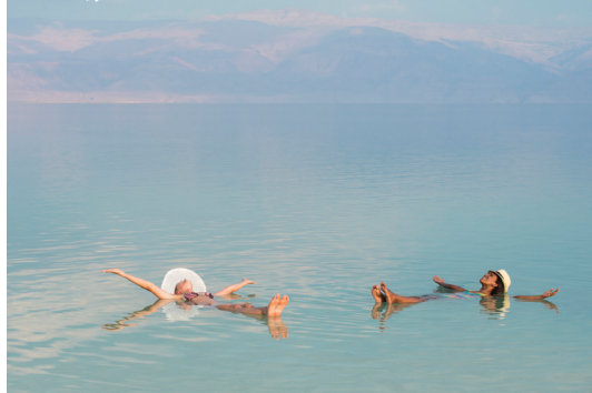
Dead Sea, Jordan

of years. We finish the day with a relaxing cruise on the Sea and Galilee and get a new and different perspective on the ministry of Christ. The boat is a replica of the same style of boat that were used by fishermen on the Sea of Galilee 2000 years ago.